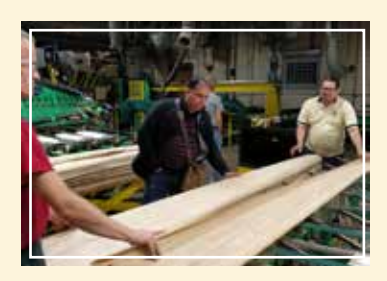
— STEP 2 — SLICING