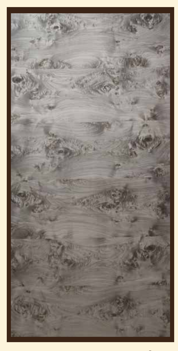
Grey Goose Burl