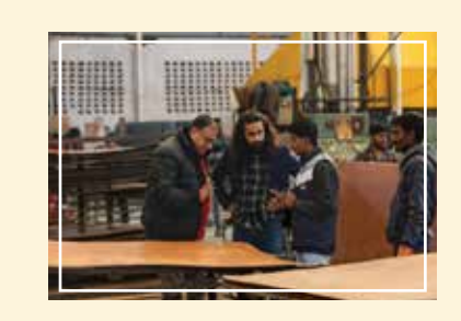
PANEL QUALITY CHECK