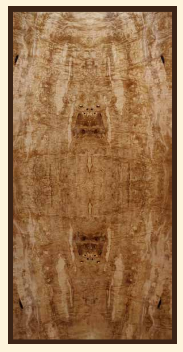
Ash Pomele Burl