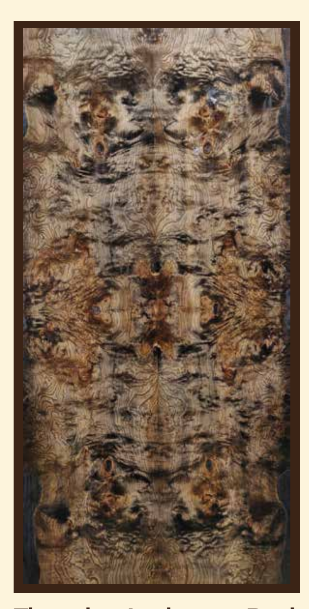
Thunder Amboyna Burl