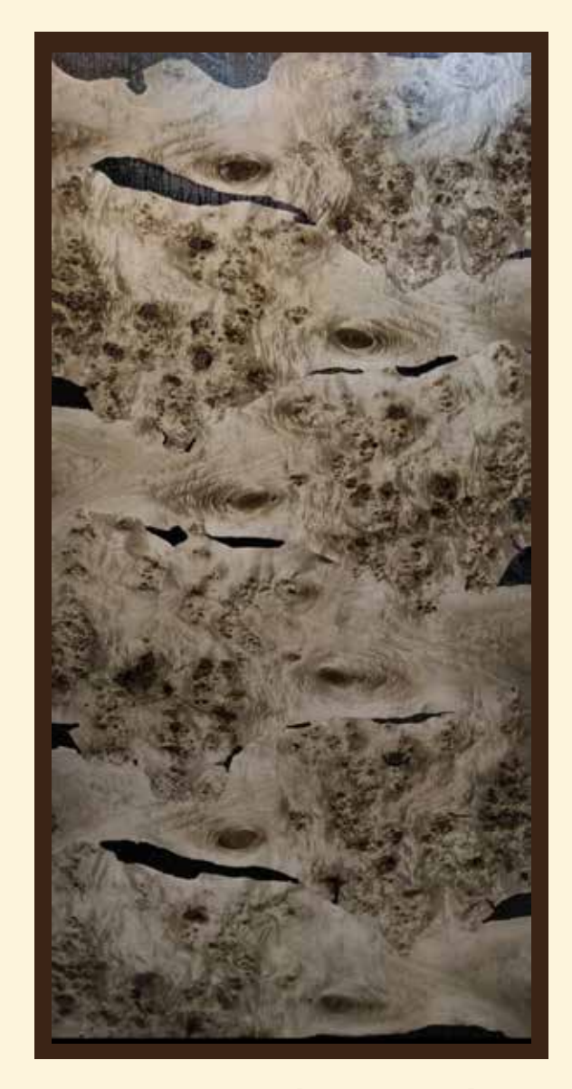
Prunus Ashen Burl