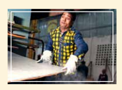
— STEP 7 — PRESSING