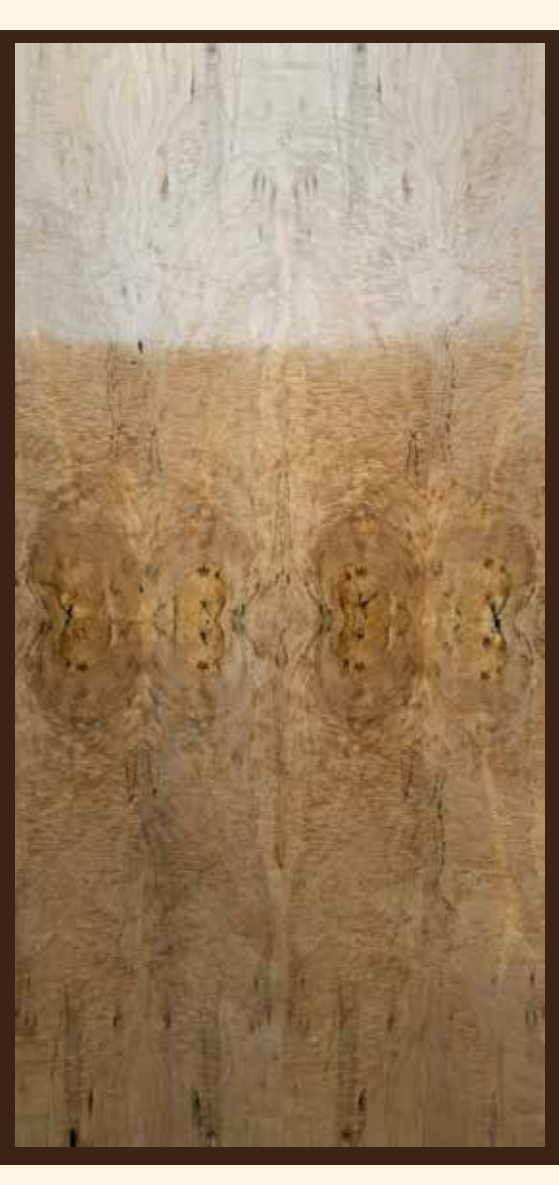
Roseate Maple Burl