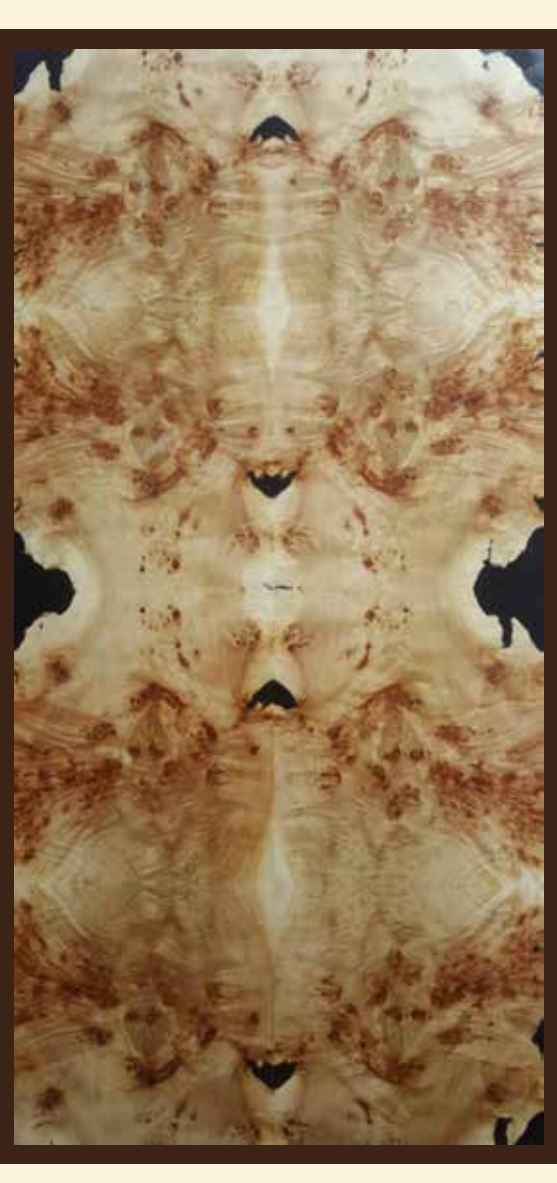
Myola Acer Burl