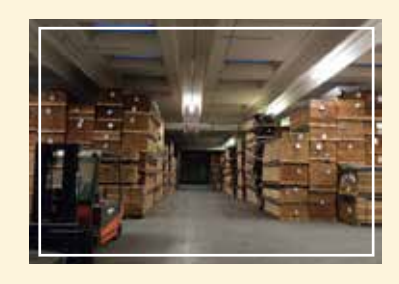
—— STEP 5 —— WAREHOUSING