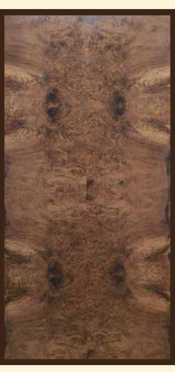
English Walnut Burl