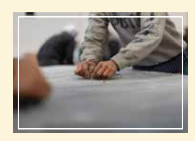
— STEP 8 — FINISHING