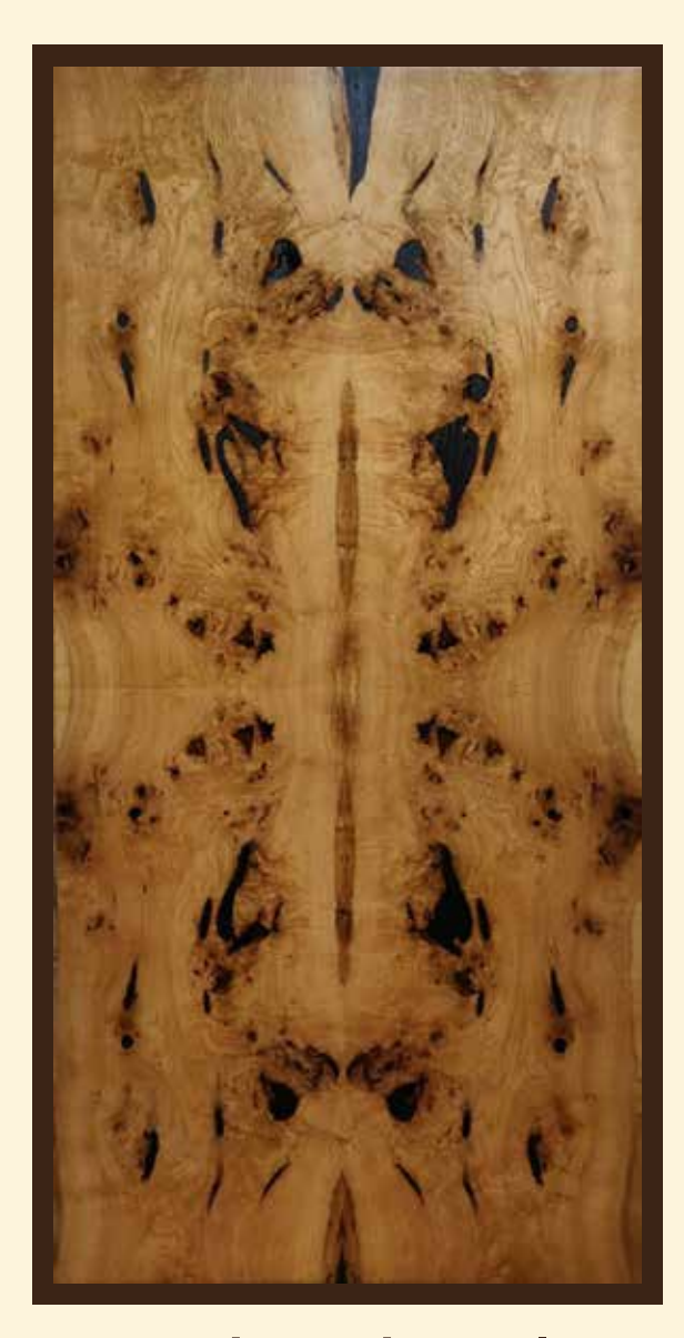
Oak Bark Burl