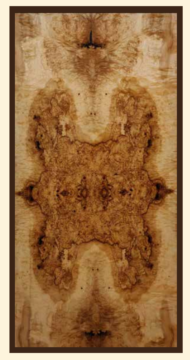
Juglans Emperor Burl