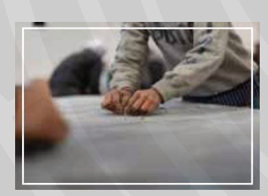
— STEP 8 — FINISHING