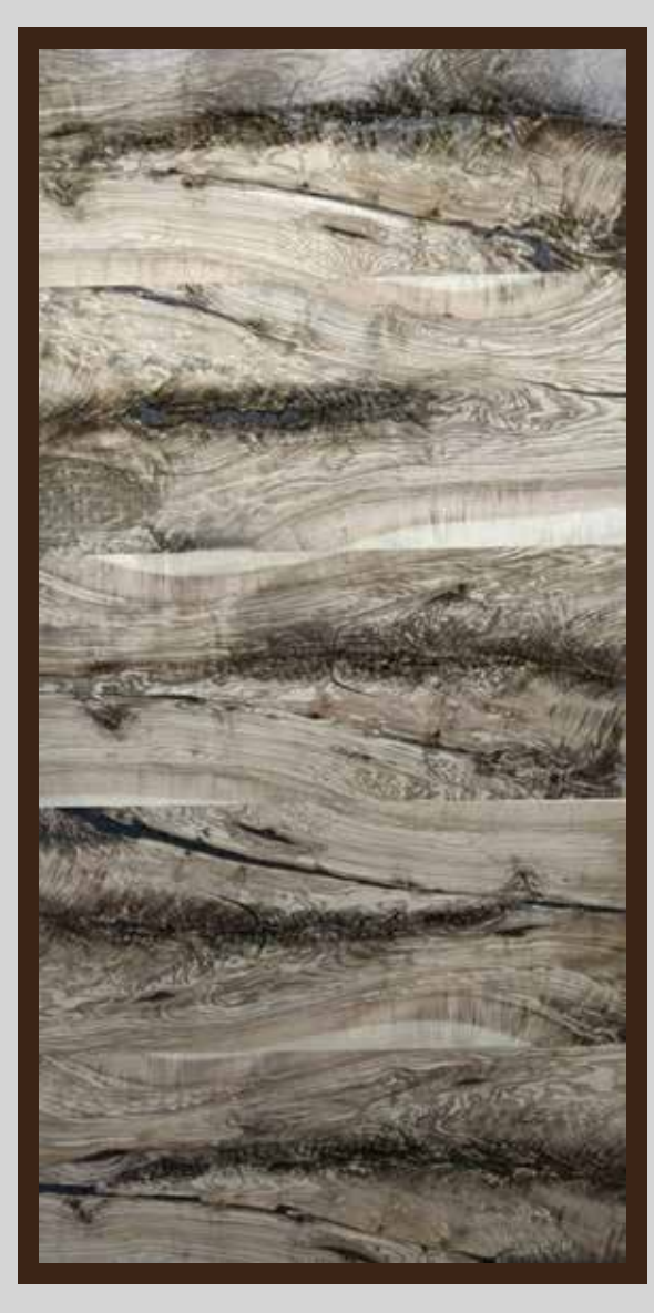
Scarlet Dyed Crotch