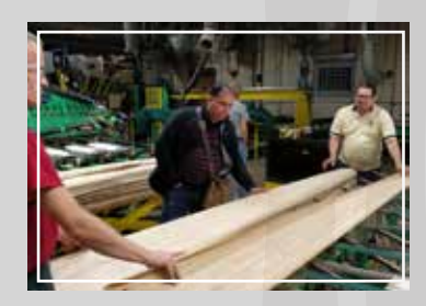
— STEP 2 — SLICING