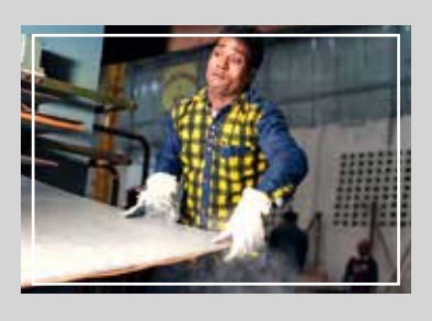
— STEP 6 — GROUPING