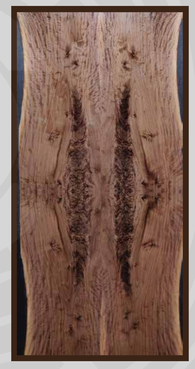
California Walnut Crotch