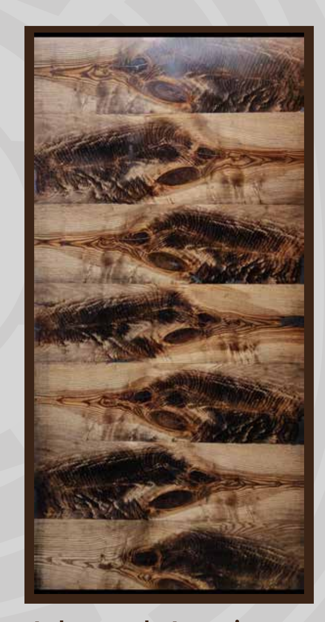
Ash crotch Americano