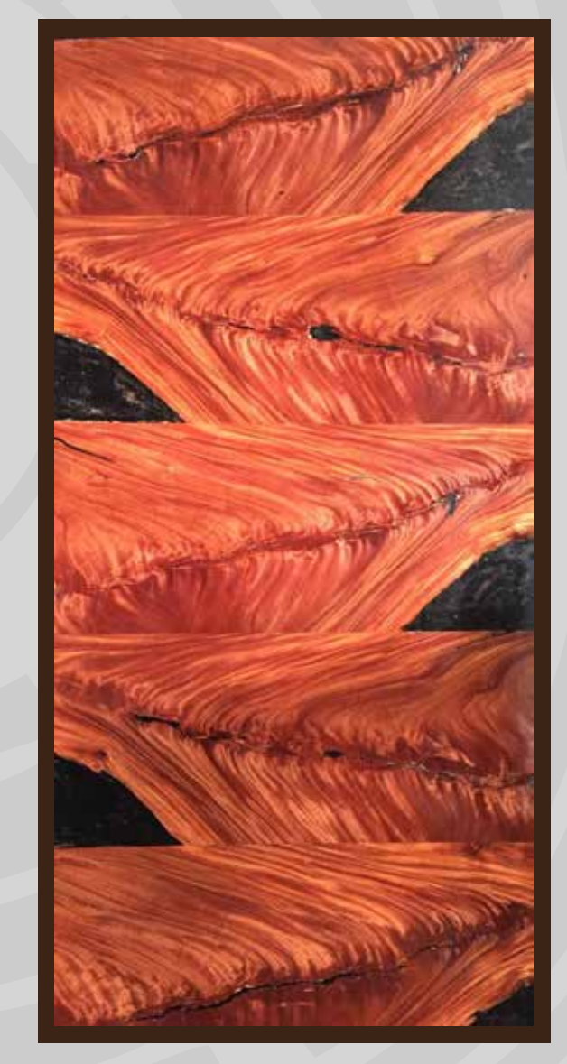
Titanium Mahogany Crotch