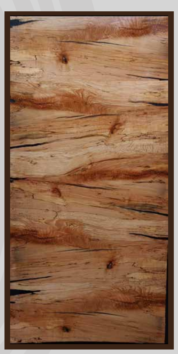
Spalted Elante Crotch Emerald Walnut Crotch