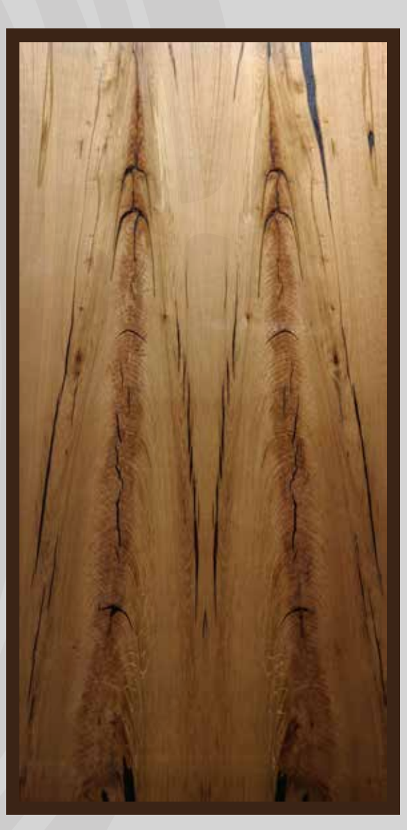
Diamond Oak Crotch