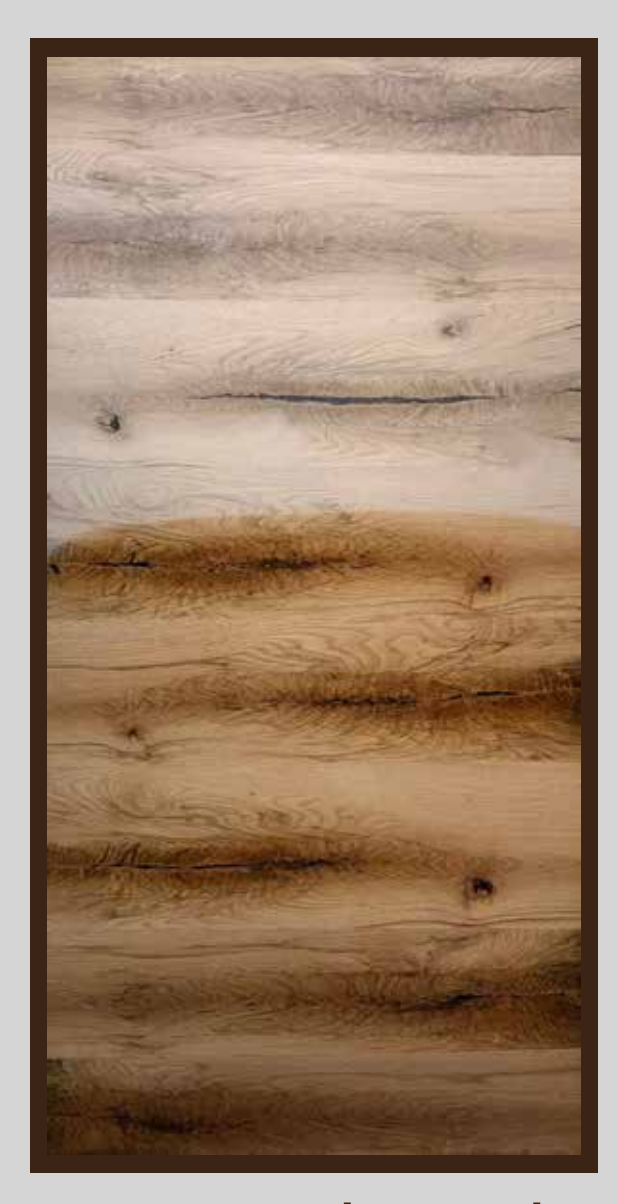
Verona Oak Crotch