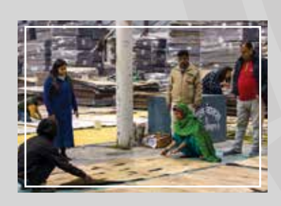
— STEP 7 — PRESSING